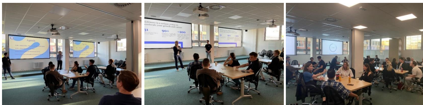
Career Speed Dating