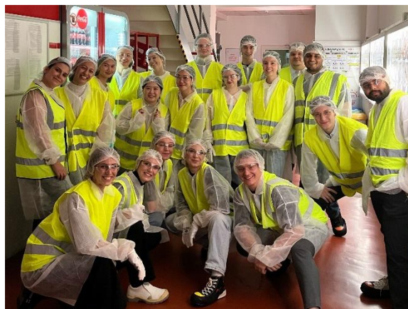
Skill Seminar with Coca-Cola HBC

In case of your interest, see the photo gallery .