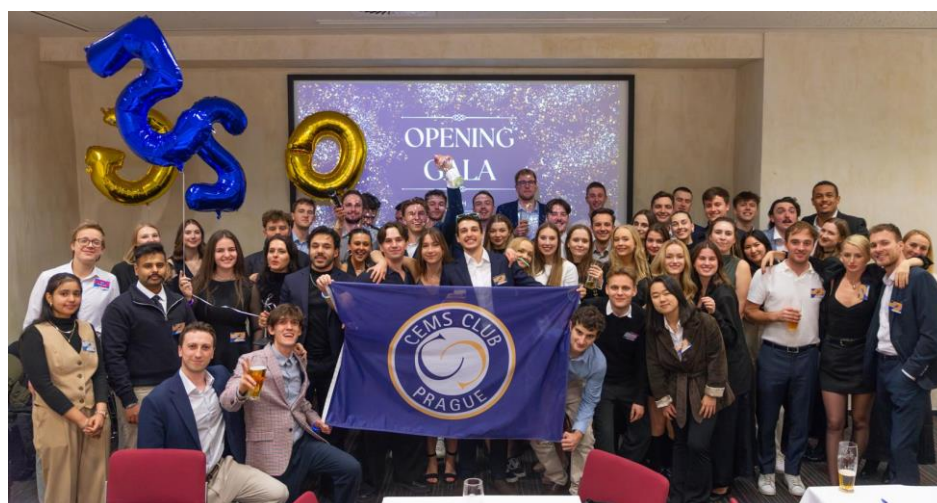
Opening Gala at the Beginning of Term 2