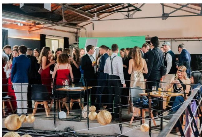
Closing Gala at the End of Term 1