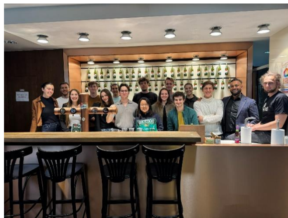
Skill Seminar with ASAHI

In case of your interest, see the photo gallery .