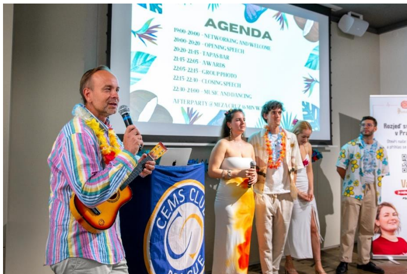
Closing Gala at the End of Term 2