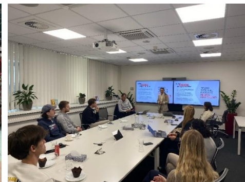
Day in The Mall with URW