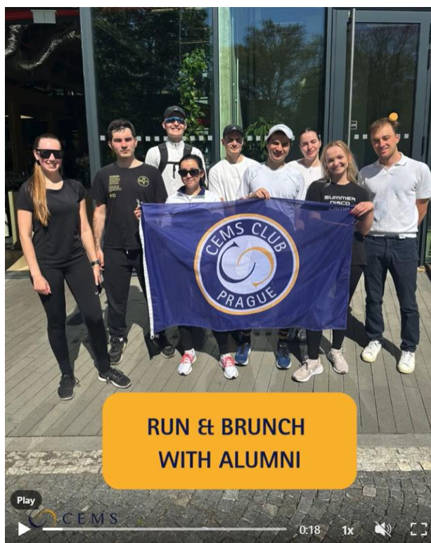
Run&Brunch with Alumni