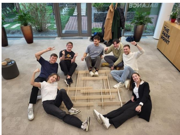
Skill Seminar with Hilti