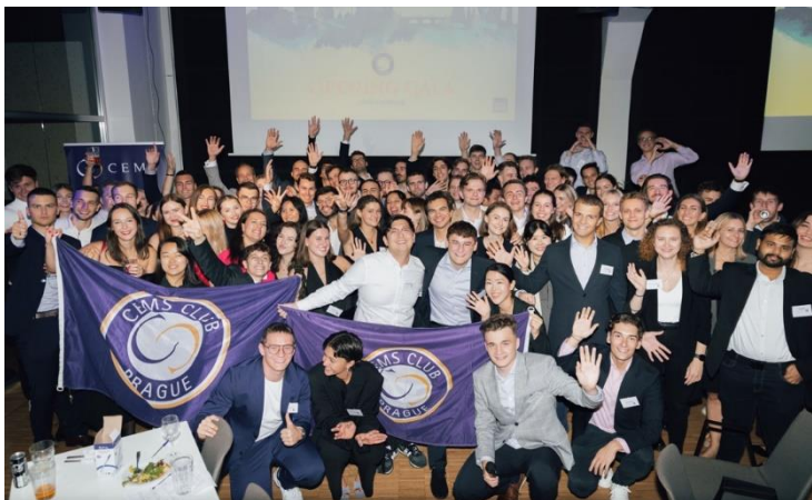
Opening Gala at the Beginning of Term 1