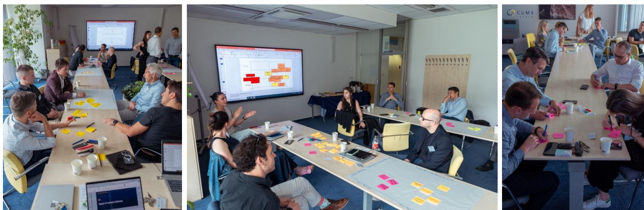
CEMS Round Table at VSE

Several of these curriculum innovations will take effect as early as September 2025. We sincerely thank all participants for their invaluable contributions and enthusiasm in shaping the future of our programme.