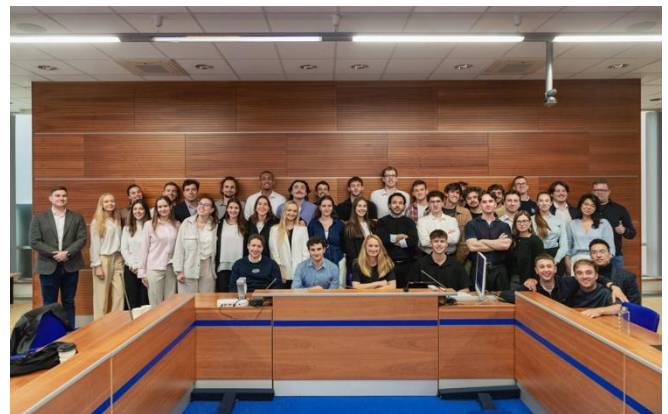
Business Projects Final Presentations at VSE

Project results are evaluated by academic and corporate supervisors. Students write a report and give an oral presentation, both as a group.