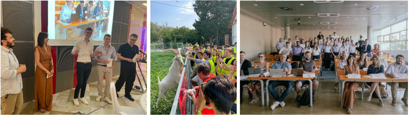
Block Seminar with Asahi

In case of your interest, see the photo gallery . The article about the past BS was published here . More information about the past Block Seminars can be found on this website .