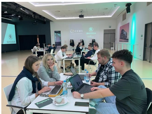
Skill Seminar with Škoda Auto