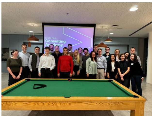
Consulting Academy 1: Accenture