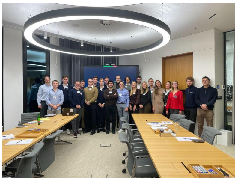
Consulting Academy 2: McKinsey & Company