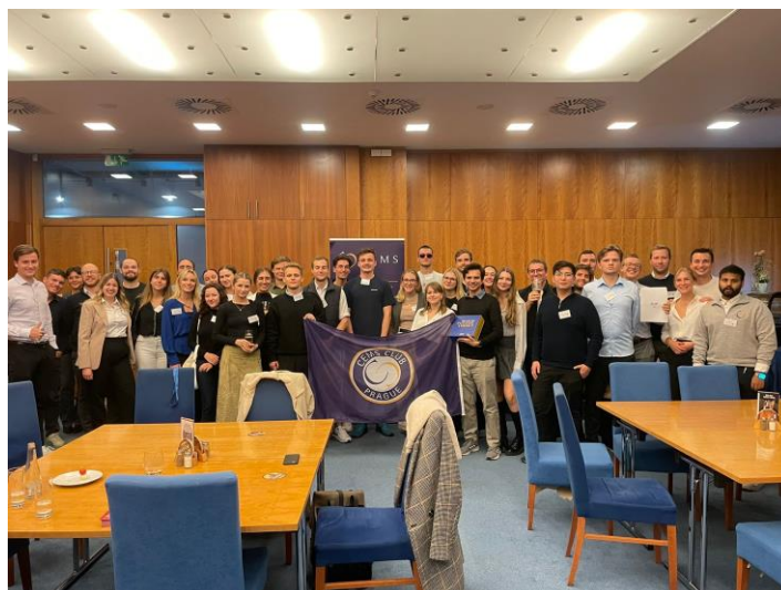
Sip & Talk with Corporate Partners at VSE